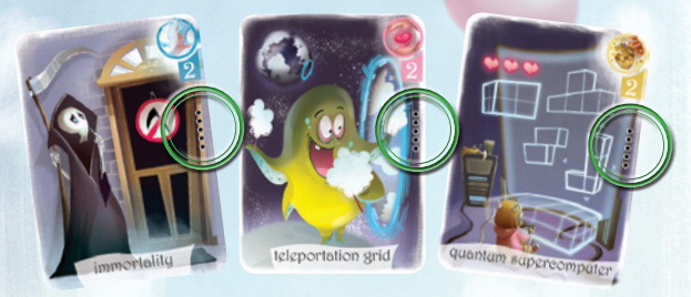
Cards with 5 players symbol

* Remove from the game the top card from the deck, without revealing it to any player.