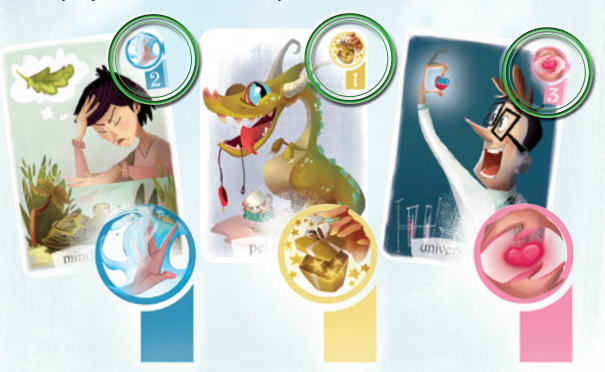
Symbols: Superpower, Gift and World Harmony